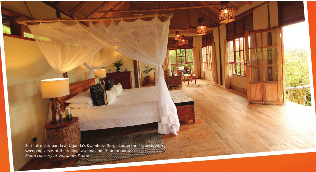
Each afro-chic banda at Uganda's Kyambura Gorge Lodge thrills guests with sweeping views of the rolling savanna and distant mountains.

in Uganda plus one in neighboring Rwanda. In addition to mountain gorilla trekking, Volcanoes Safaris takes guests to see human's closest genetic relatives, chimpanzees, in the Kyambura Gorge; fluffy-cheeked, endangered golden monkeys that nibble on bamboo shoots in the Virunga Mountains; as well as elephants, Cape buffalo, lions, hippos and herds of the stately-horned national antelope, the Ugandan kob.