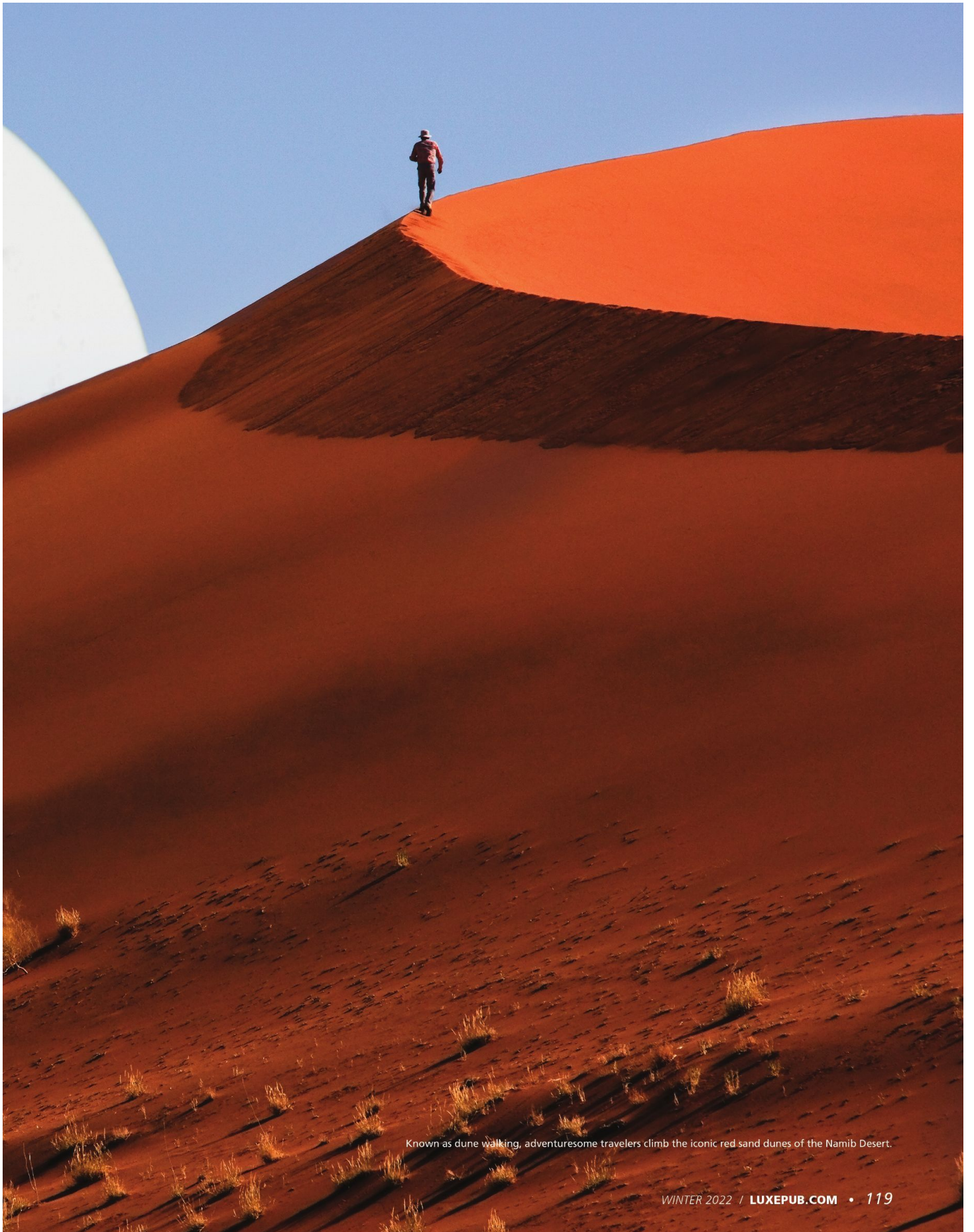
Known as dune walking, adventuresome travelers climb the iconic red sand dunes of the Namib Desert.