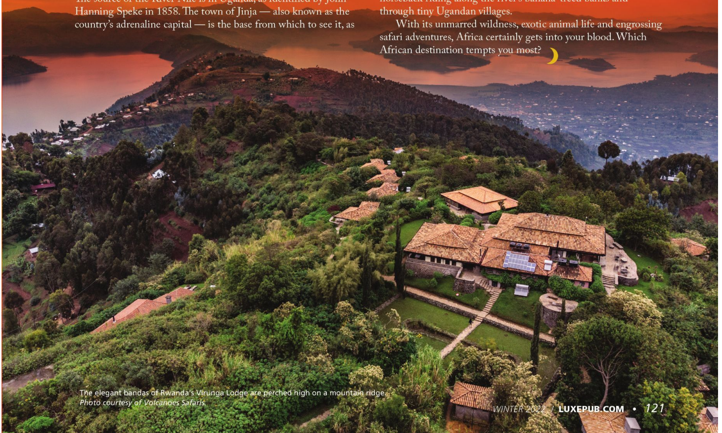
The elegant bandas of Rwanda's Virunga Lodge are perched high on a mountain ridge.

With its unmarred wildness, exotic animal life and engrossing safari adventures, Africa certainly gets into your blood. Which African destination tempts you most? 🌙