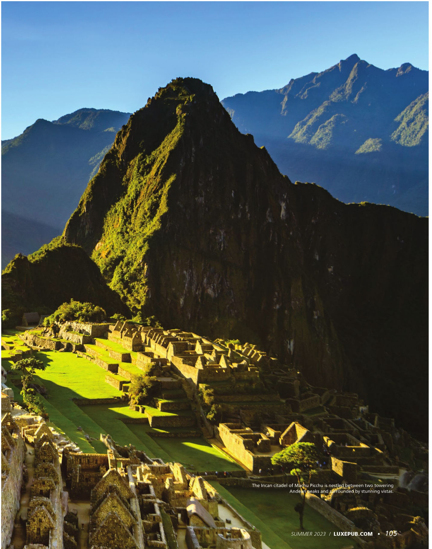
The Incan citadel of Machu Picchu is nestled between two towering Andean peaks and surrounded by stunning vistas.