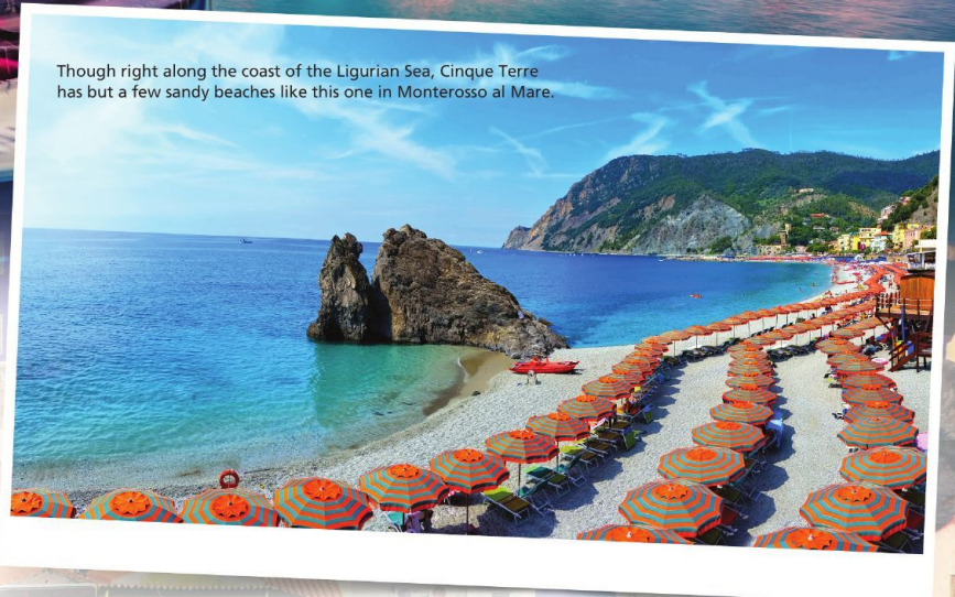
Though right along the coast of the Ligurian Sea, Cinque Terre has but a few sandy beaches like this one in Monterosso al Mare.

The westernmost and largest coastal municipality is Monterosso, the only town of the five lands that allows cars into its city center. This village sits at sea level with several sandy beaches to roam and a few four-star hotels where you can rest your weary head. Travelers know this area for its anchovies, olive