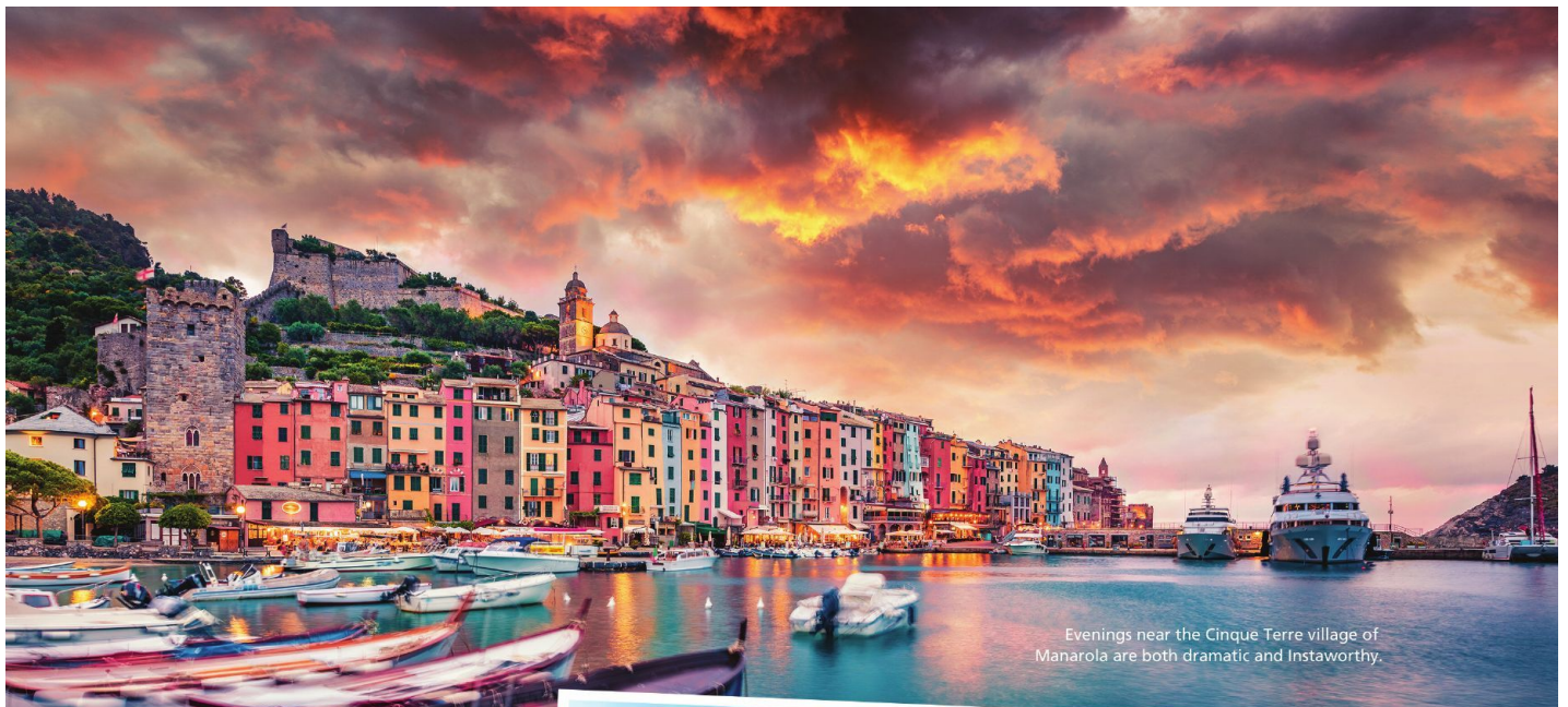
Evenings near the Cinque Terre village of Manarola are both dramatic and Instagram-worthy.